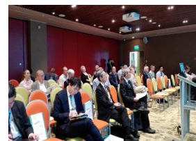
Seminar in Kazakhstan (Astana)