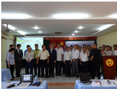
Workshop concerning the legal system of energy conservation (January 25)