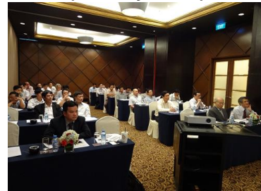
Seminar (January 29)

In response to Vietnamese MOIT's request, we provided the following support for the promotion of energy conservation at an energy-intensive electric furnace factory.