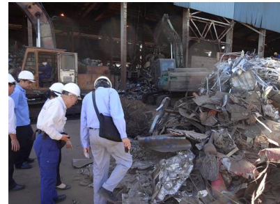
On-site inspection-1 (January 26-27)