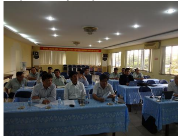
Proposals based on the survey result (January 28)