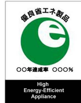
Label for the product's main unit

As of March 2015, this labeling program covers the following 21 Top Runner products: air conditioners/ electric refrigerators/ TV sets/ electric freezers/ lighting equipment/ electric toilet seats/ electric rice cookers/ microwave ovens/ DVD recorders/ gas cooking appliances/ gas water heaters/ oil water heaters/ computers/ magnetic disk units/ space heaters/ transformers/ routers/ switching units/ AC motors/ Self-ballasted LED lamps/ Electric water heaters(heat pump type water supply systems)