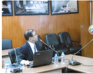
A lecture on energy conservation guidelines