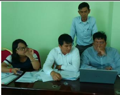
Preparing an action plan