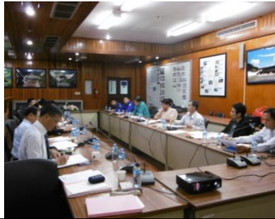
Discussions between relevant government agencies