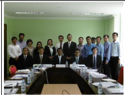
Participants of Workshop

In Lao PDR, we held discussions with the participants from Ministry of Energy and Mines, Ministry of Industry and Commerce, Ministry of Public Works and Transportation, Ministry of Science and Technology, Customs department and the National University of Laos for finalizing the draft of ministerial decree on energy conservation. We also gave a lecture on the details of the qualified energy manager system, energy conservation guidelines and the S&L system. This helped the participants deepen understanding of the specific procedure to establish the systems and the necessity to start the establishment process at an early date.