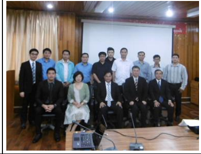
Participants of Workshop