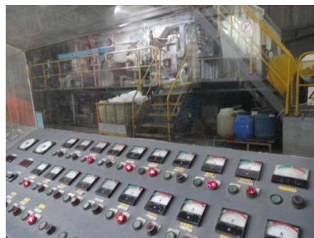
A plant in Shandong Province